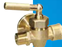
PRESSURE GAUGE FLANGE G 3/8"