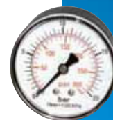
PRESSURE GAUGE Ø 63 mm G 1/4"