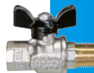
BALL TAP G 1/2" - G 1"